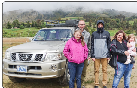
Here are a few of our latest family photos. We recently visited Cristo de la Concordia and drove out to Corani Lake (our first trip outside the city).