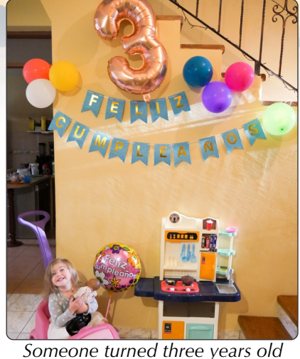
Someone turned three years old this month!