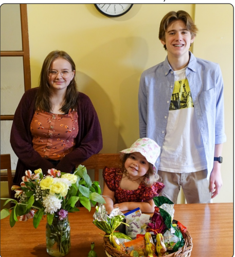
The three kids on Easter.