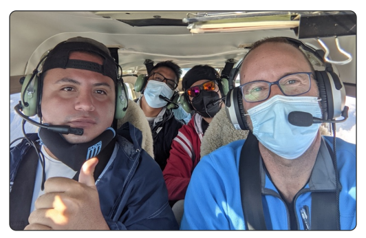
It's encouraging to see Bolivian churches get excited and invest in the ministries of ITM. Several volunteers from a church in Cochabamba have given weeks of their time to serve with us in San Lorenzo.