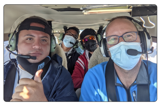
It's encouraging to see Bolivian churches get excited and invest in the ministries of ITM. Several volunteers from a church in Cochabamba have given weeks of their time to serve with us in San Lorenzo.