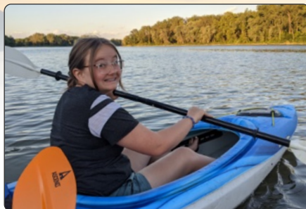
We are thankful for friends who are storing our kayaks for us! It was a blessing to use them while in Ohio.