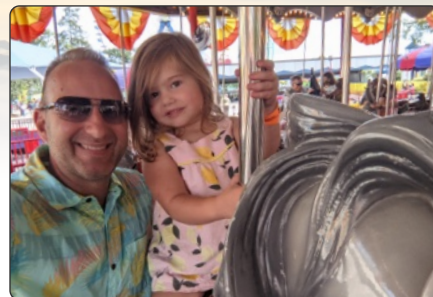
The extra time we had in the USA was an unexpected blessing, and we tried to make the most of it.