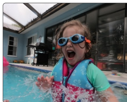
Someone loved swimming in Grandma's pool!